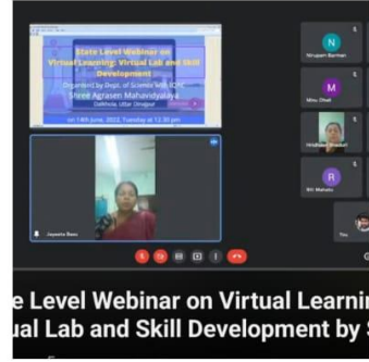
State Level Webinar on Virtual Learning, Virtual Lab and Skill Development by S...